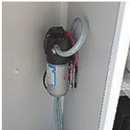
12 Volt Pump