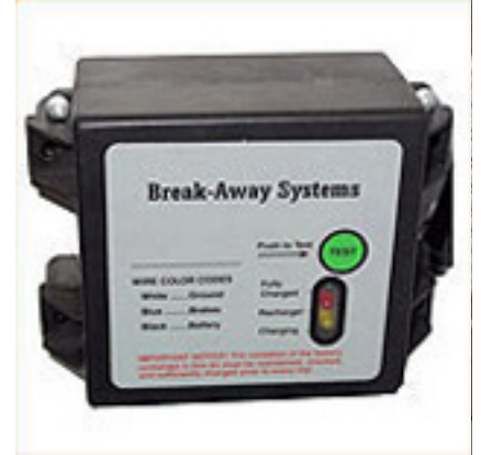
Break Away System

Custom Build Horse Floats available to suit our clients requirements, whether it be a standard size float or a custom gooseneck. We have several models of horse floats in stock - 2, 3 & 4 horse straight/angle load floats, that can be customised to suit the needs of you and your horses.