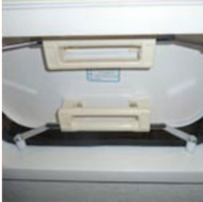
Pop Up Air Vents