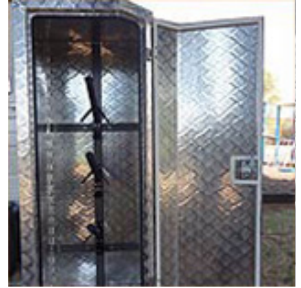
Saddle Box Storage

With over 20 years of experience all our efforts and knowledge have been utilised to provide you the best possible Horse Float at Factory Direct Prices. Call Us today for a FREE quote!