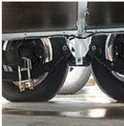
Suspension Brake Away