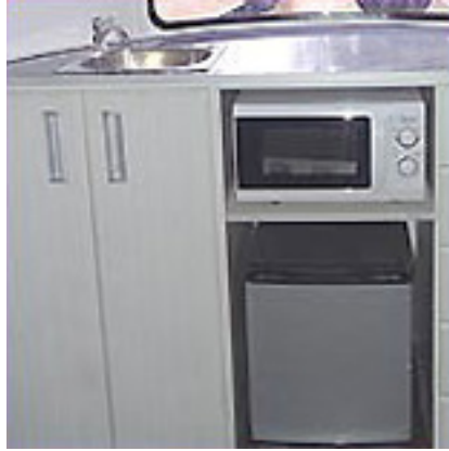
Sink & Microwave