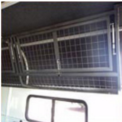
Overhead Rug Rack

Custom Build Horse Floats available to suit our clients requirements, whether it be a standard size float or a custom gooseneck. We have several models of horse floats in stock - 2, 3 & 4 horse straight/angle load floats, that can be customised to suit the needs of you and your horses.